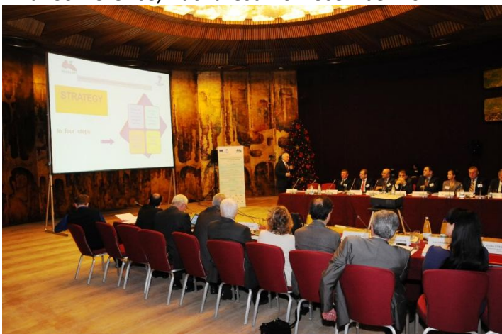
Partners meeting, Bucharest 11 December 2012